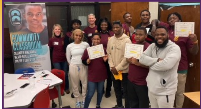
Booker T. Washington High School's newest Values Based Leaders! Congratulations Bookers!

"It really helps me and shows me where I need to improve in life." "It has been very helpful with my life in general, and they (these discussions) have changed me as a whole."